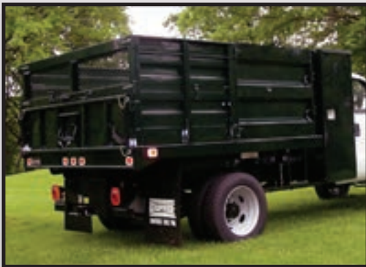
PLB-090B with KPLS-942463A