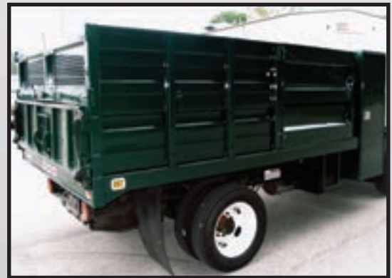
PLB-110B with KPLS-942463A